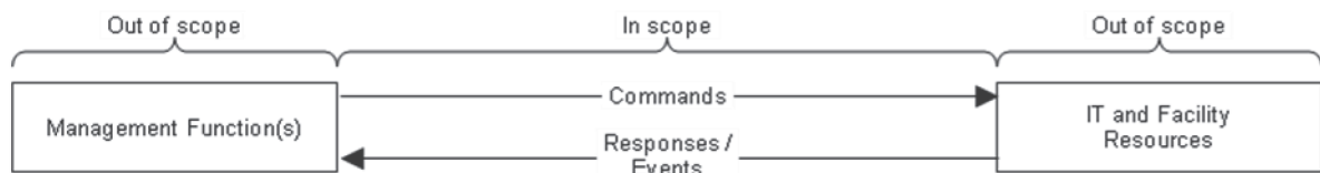
Figure 1 — Scope

In the Smart Data Centre, Management Functions monitor and control Resources. Resources model IT and facility equipment, systems and components in a data centre. To monitor and control the Resources' Properties, Management Functions exchange command, response or event Messages with Resources, see Figure 1 .